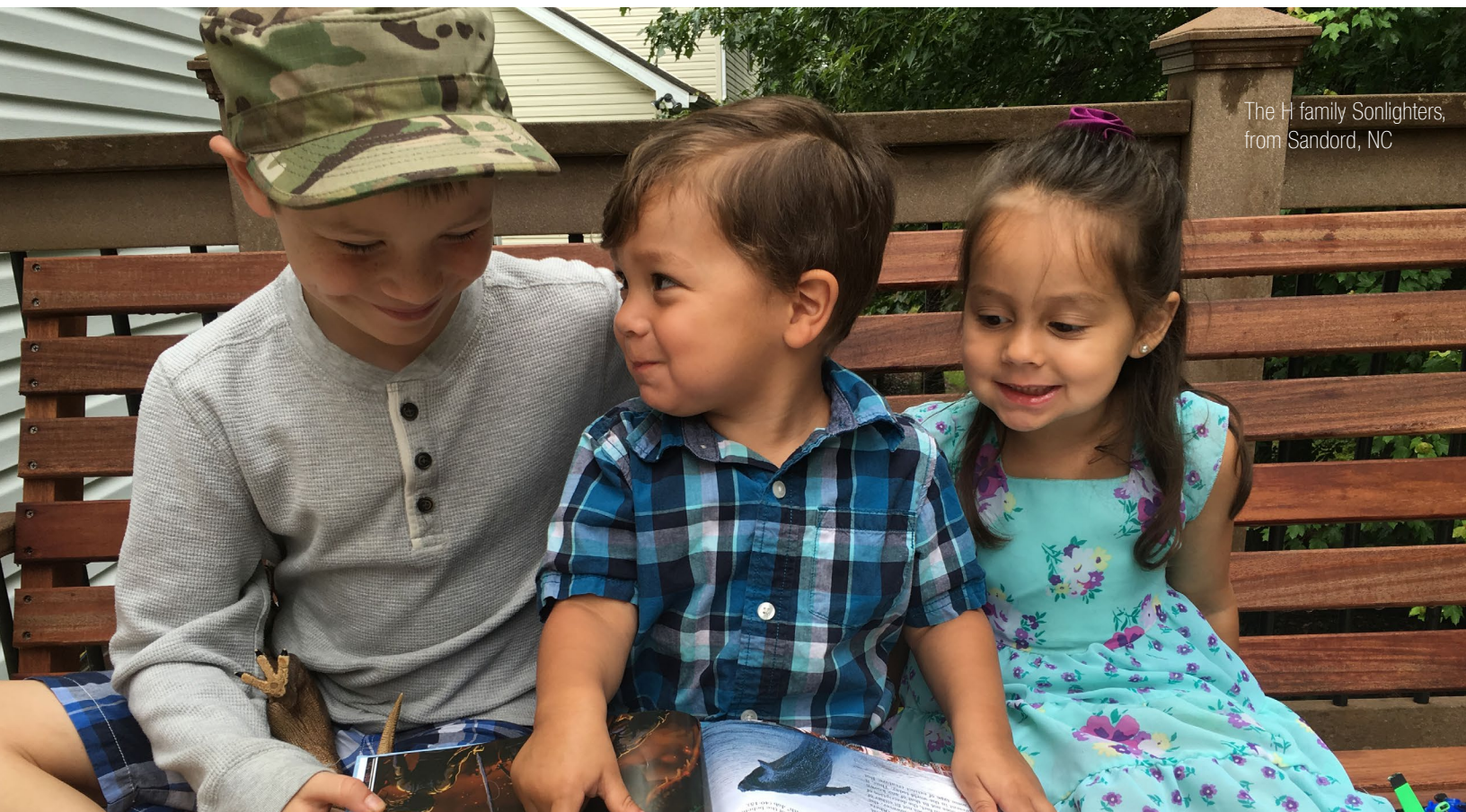
The H family Sonlighters, from Sandord, NC

And now, we are pleased to talk through some things for you to think about.